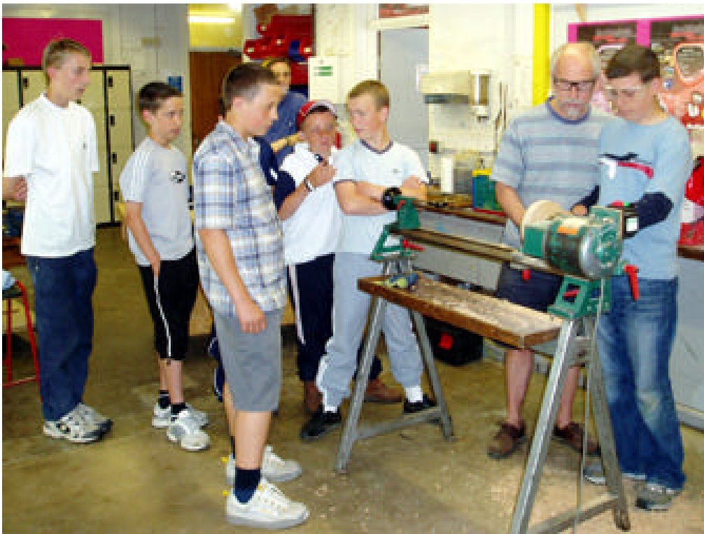
Mountbatten school pupils queue for a turn.