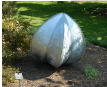
“Silver Seed” Mike Savage (Aluminium)